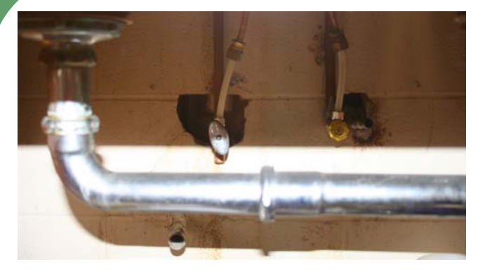
Areas surrounding pipes need to be sealed to prevent mouse entry.