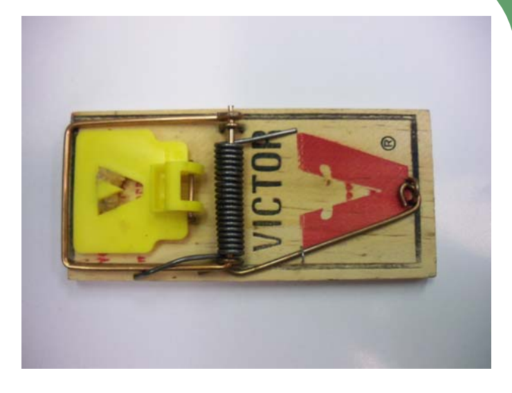
The Victor snap trap with expanded trigger.

Careful inspection should be done before ending trapping as multiple infestations are <u>not</u> uncommon.