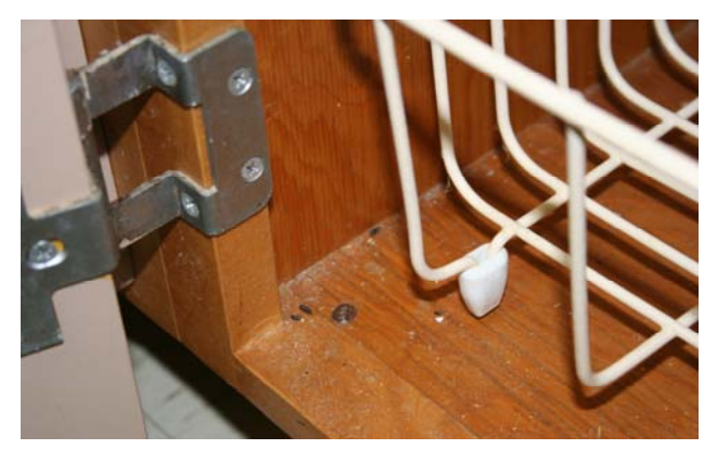
Mouse feces in cabinet under sink in an FCS classroom.